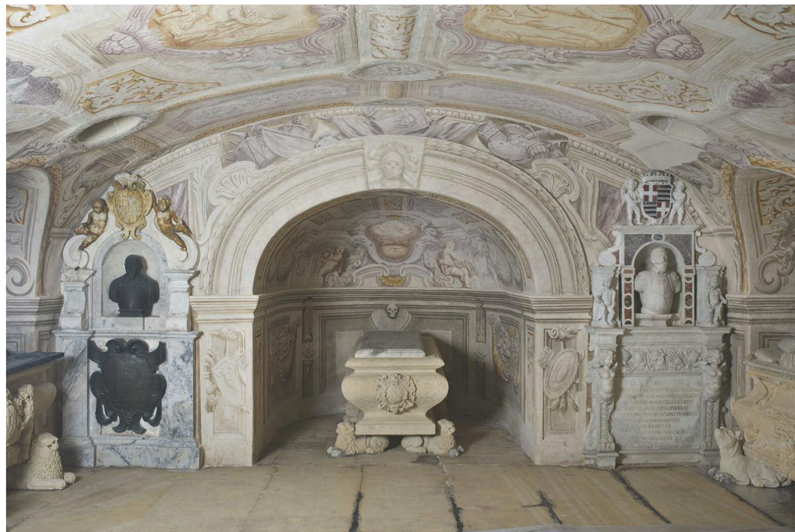
The Grand Master's Crypt at St John's Co-Cathedral, winner of the Din l-Art Helwa Prix d'Honneur in the category Restoration and Conservation in 2019. Right: The Maçina Project, an award winner for best readaptation and reuse of buildings in 2018.